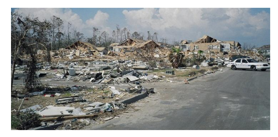
New Orleans after Hurricane Katrina

Construction and new development can drastically alter the landscape, resulting in insufficient drainage and runoff. In addition, more houses, parking lots, and roads mean less land to absorb excess water.