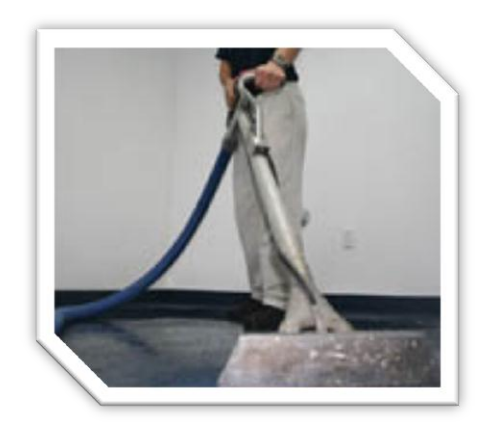
Water Damage Restoration

This is the process wherein the excess water is removed from the home. Depending on the depth and severity of the spill, either wet-dry vacuum units or gas powered submersible pumps will be utilized. Electric pumps are discouraged as electricity and water do not mix, and any attempt to remove water with a normal vacuum cleaner will only result in the purchase of a new vacuum.