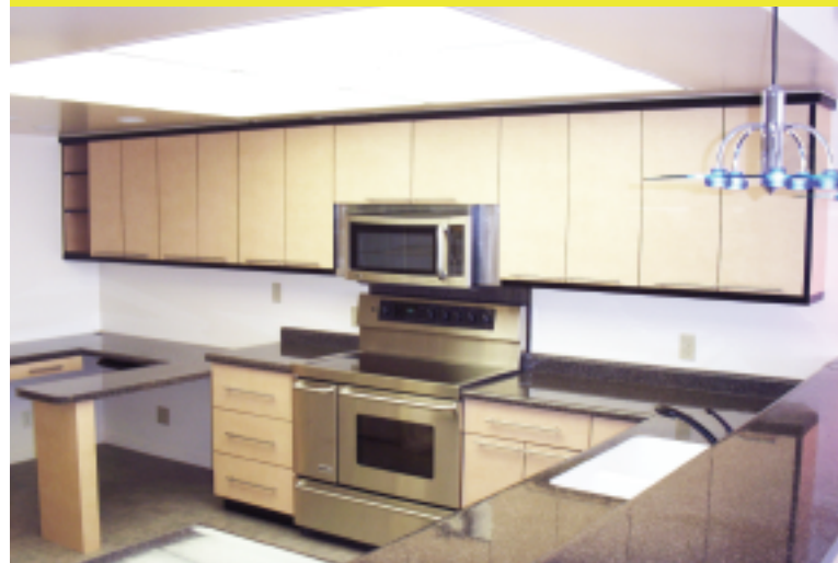
Contemporary style "Urban Loft" Kitchen. Cabinetry and Countertops done in Laminate.