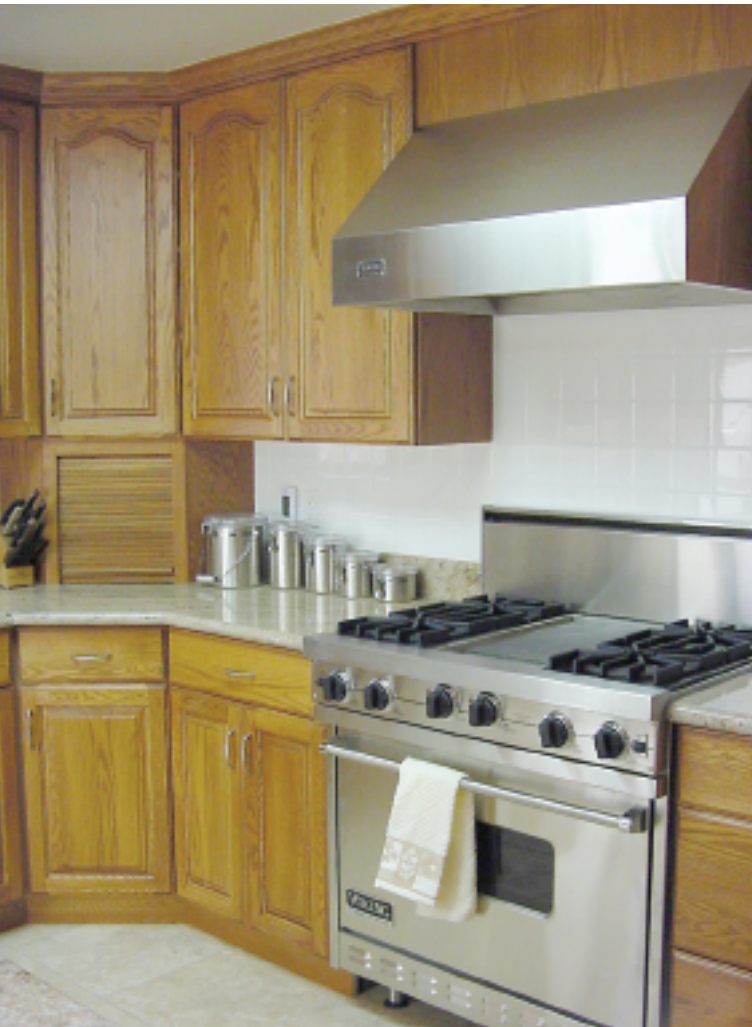
Upscale "Gourmet Kitchen". Medium Walnut on Oak Cabinetry, Granite Countertops, Travertine Floor.

And re-facing alone does not solve the problem of broken, worn or sticky rollers and mechanisms on drawers. Another huge benefit of all new cabinets and drawers, is that we can make them deeper, larger and more functional than your current ones."