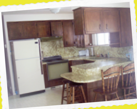
Scary Kitchen Before

A complete dream kitchen... top quality...top to bottom... floor to ceiling...in just 3 days! That's the magic of 3 Day Kitchen and Bath!