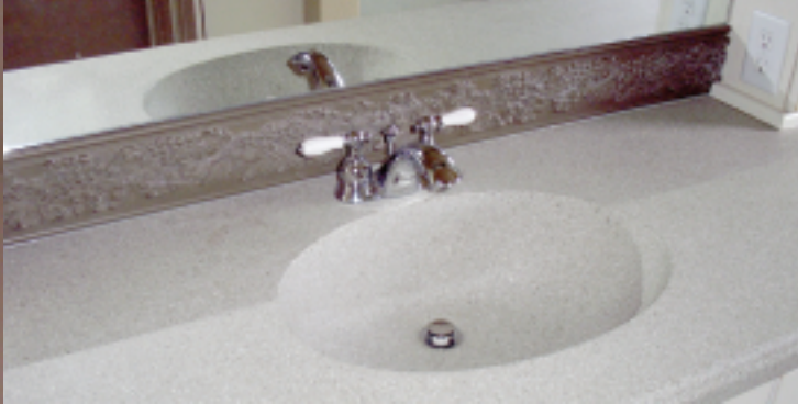
French Country Style Bathroom. Rustic Buttercream on Beadboard Alder Cabinetry, "Oregon Coast" Aggregate Countertops with matching integrated vanity bowl, Nickel Grape Leaf Backsplash.

"The other night we had a large gathering with 38 people in attendance. My new kitchen design facilitated the feeding of that many people. On top of that it with the new design and materials it was so easy to clean up afterward."