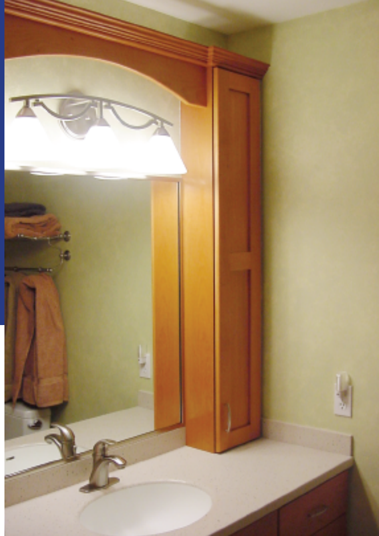
Alder Wood Shaker Style Cabinetry, Solid Surface Countertops with integrated vanity bowl.

Answer: "Mixing woods is perfectly acceptable. Whether you want an eclectic look or a more traditional kitchen, intermingling different woods and textures adds interest and beauty to your new room."